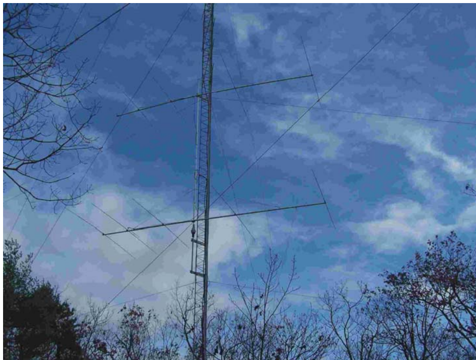
The South America Antenna

Here is the South America antenna. I stuck it on a rotator so that it has limited rotation from about 150 to 300 degrees. It also works great to the USA and VK as a result. None of the guy wires have insulators, (It is my 222 MHz tower) so there is some interaction, as my VHF towers are close together and at last count I had eight towers with guy wires all over the place. but I see big improvements over a single yagi in most of the directions it will cover.