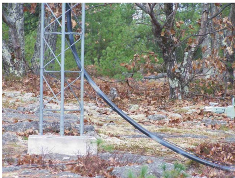
RG8-X bends better than this stuff!

From August to mid November, I have been slowly getting everything erected and running. I put up a 70 ft Rohn 45 tower with Phillystran guy lines. Next I built up a few more ten meter yagis and started installing them at 70, 50, and 30 ft. At the same time I got designing a switch box to handle the tower side RF switching chores. The commercial boxes available use UHF connectors with small spacing between connectors to fit the normal RG-8 coax. My plan was to run about 275 ft. of 1 5/8" Heliac up the tower and connect each of the three yagis with shorter runs of 7/8" Heliac. Once you put heat shrink and then the butyl rubber layer and vinyl tape on the brass connectors, they start to look like the size of your fist! No way they would fit on a Stack Match or the DX Engineering box. I am still working the bugs out of the installation in my spare time, but as of November 15, the antenna is basically working.